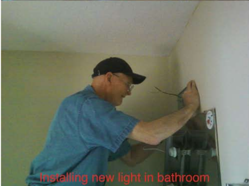
Installing new light in bathroom