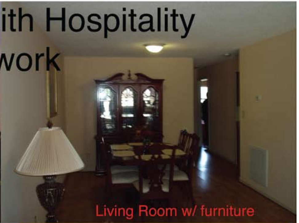
Living Room w/ furniture